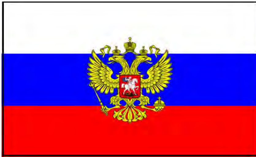
(Russian Imperial flag in WW1)

Of the approximately 300000 personnel who served in the Australian Imperial Force in World War 1 the majority of the non-Australian born were from the United Kingdom. The 2 nd largest group of non-Australians were from Russia. This was Imperial Russia, prior to the 1917 Revolution, and includes places such as Latvia and Finland